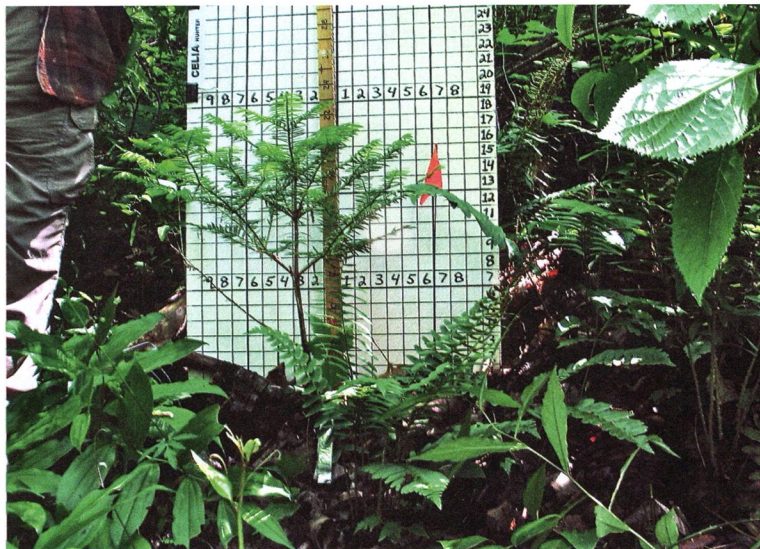
RIGHT The Torreya Guardians document the health and growth of the seedlings they plant to determine optimal planting conditions for the species.

The stories of these climate refuges, far from being just curious botanical anecdotes, raise important questions about what will happen to currently well-established species as human-induced climate change