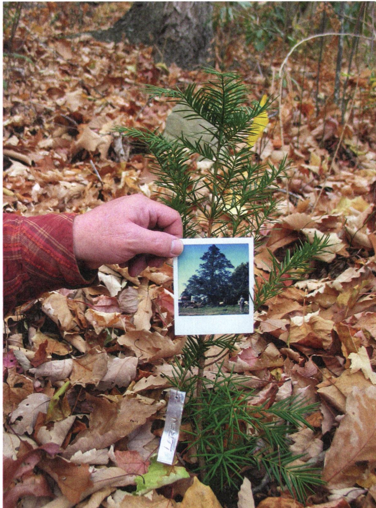
RIGHT A torreya sapling growing in North Carolina and a photograph of its parent tree.