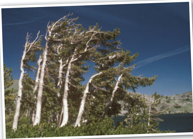
Whitebark pine is threatened by global warming.

the planting site, to account for climate change in the past century and changes anticipated in the first portion of the planted tree's lifetime," says O'Neill.