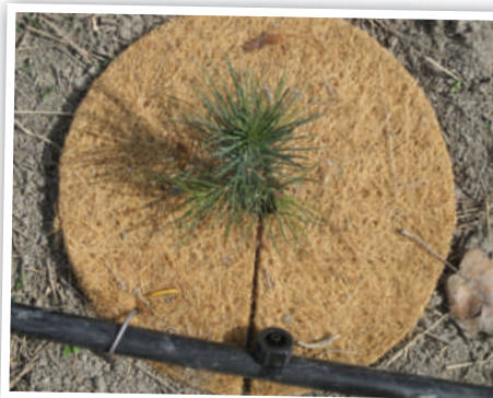
A seedling planted this year in British Columbia.