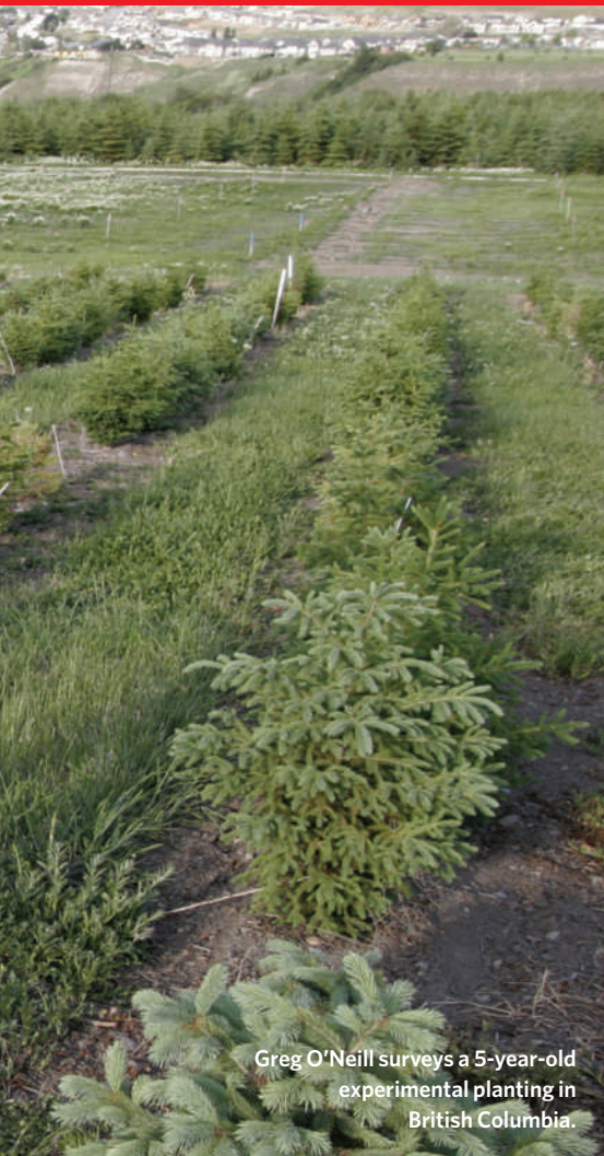
Greg O'Neill surveys a 5-year-old experimental planting in British Columbia.

because trees are not always particularly well adapted to their locations.